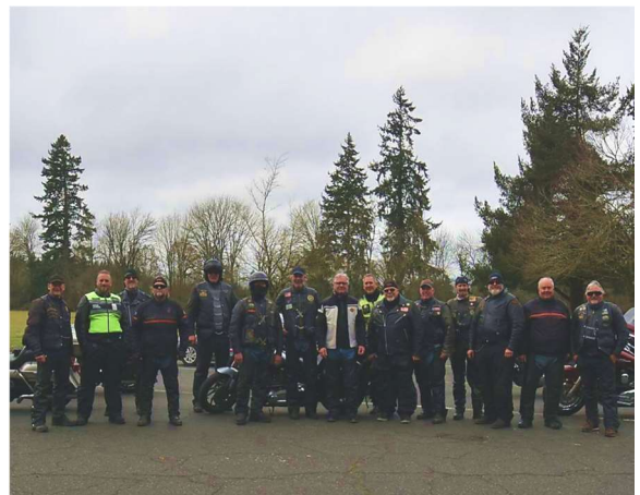
January Gauntlet Day – Our Road Captains preparing for riding season