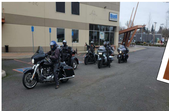
January 1 st a few brave member meet up to do The Polar Bear Ride