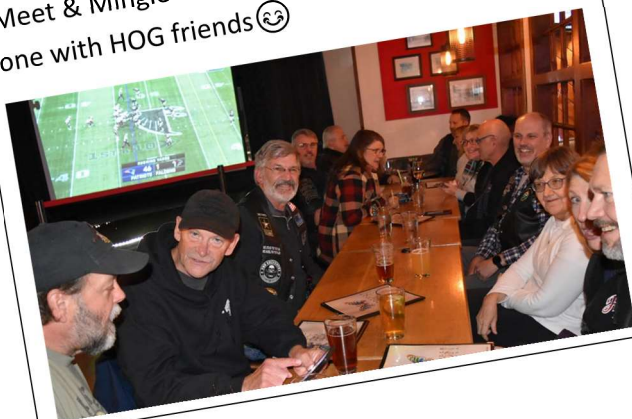
Meet & Mingle are a great time to enjoy a cold one with HOG friends ☺