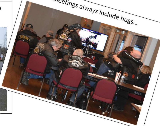
Chapter Meetings always include hugs...