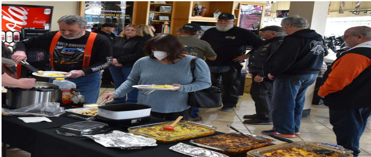
Meet & Mingle are a great time to enjoy a cold one with HOG friends ☺